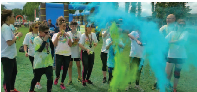
Wonderful Fundraising effort for the Welsh Guards charity by the Battalion's wives and teenagers who took part in the Windsor Obstacle Colour Rush.