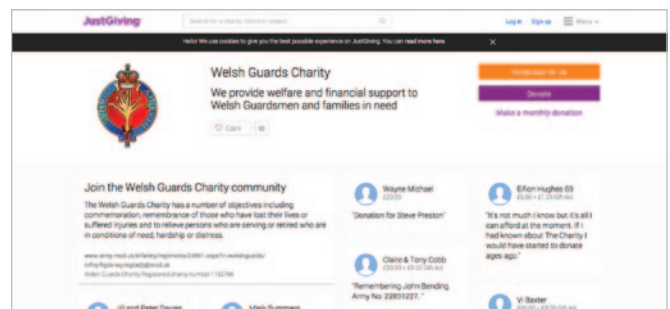
The Welsh Guards Charity Just Giving Page is proving to be a popular and easy way to donate.